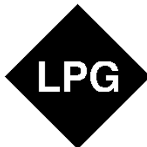
Figure LM1 LP Gas Operating Label

These labels are available from licensed LP Gas installers and should be used on all new installations. These labels may also be used to replace existing labels.