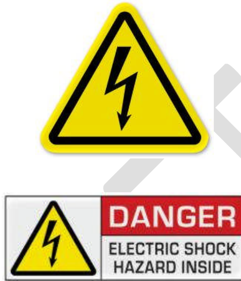
Figure 1 Warning Labels

Covers in other areas of the vehicle (including under the bonnet) must protect any exposed HAZV components to a protection rating of at least IP2X.