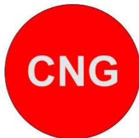
Figure LM3 NG Vehicle Identification (Illustration only)

An identification label is required for each tank fitted to the vehicle - i.e. if two or more tanks are fitted, two labels must be attached to each number plate.