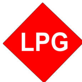
Figure LM1 LP Gas Operating Label (Illustration only)

These labels are available from licensed LP Gas installers and should be used on all new installations. These labels may also be used to replace existing labels.